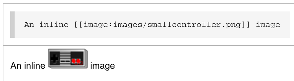
Table 2.16. Image example

Image display can be parameterized for all output but it is possible to target a specific output with a prefix. The fo prefix affects the PDF output and the html targets the HTML content. More details about docbook images parameterization can be found in the docbook imagedata reference.