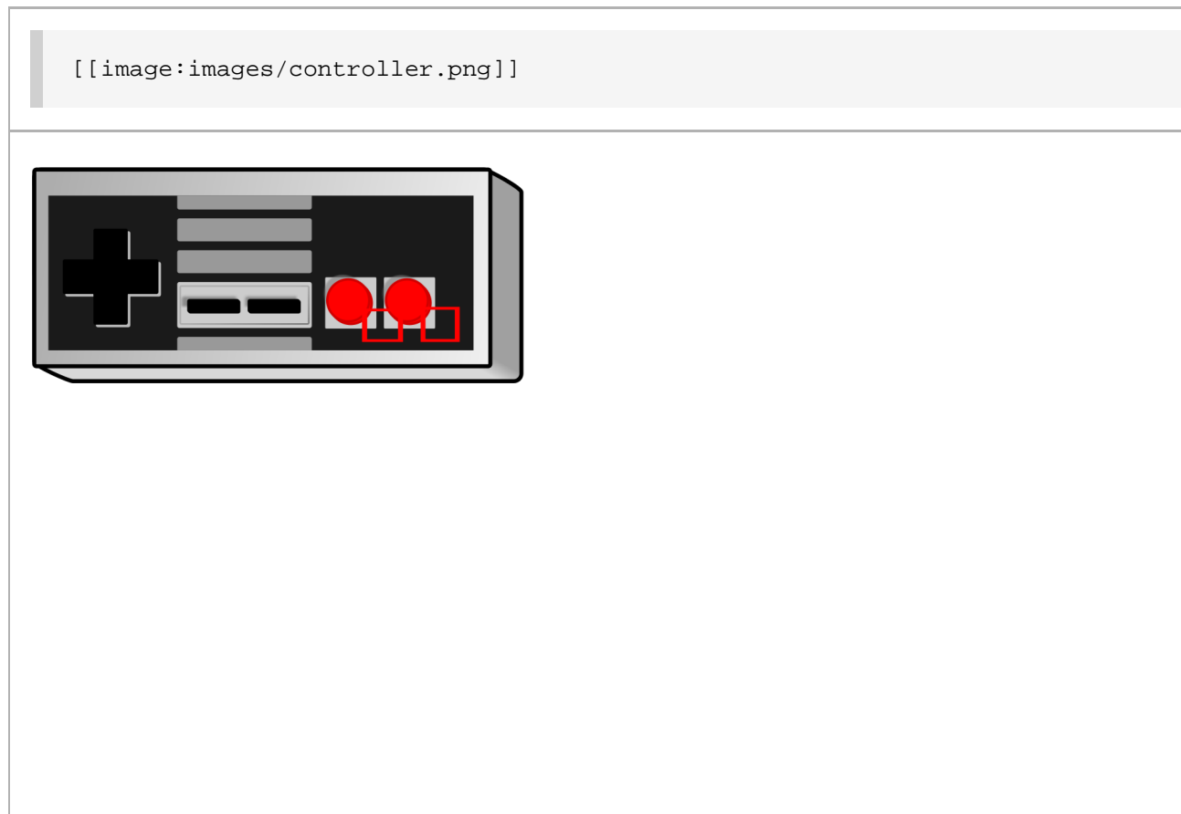
Table 2.15. Image example

Images can naturally be inlined when some text is around the image.